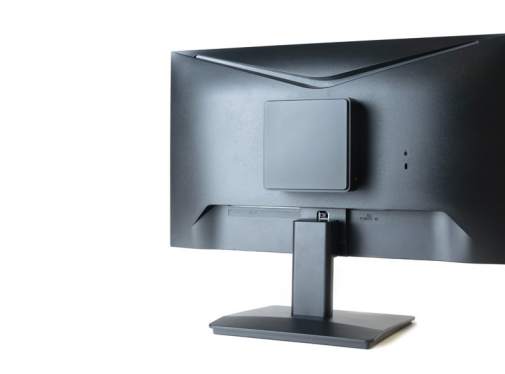
Back Of Monitor