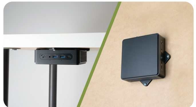
Under Desk / On Wall