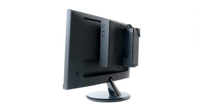
Back Of Monitor