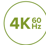
Quad 4K 60 Hz