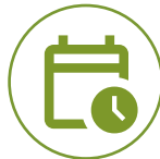
RTC Power Scheduling