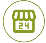
Rated for 24/7 Use