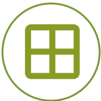
Windows 11 IoT